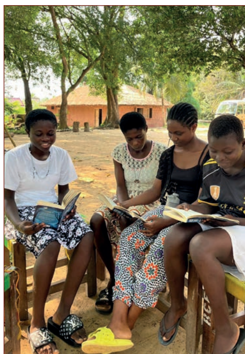
Reading under the trees