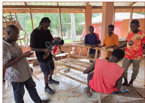
Cane & Bamboo department