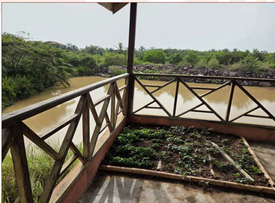
Our rainwater dam is unusual full for the dry season

The year is already moving into its third month, and I hope everyone is happy to receive news from Ghana after this cold or wet winter. Here as well, we have had rain again and again, and the feeling of being in the dry season has not really appeared. We love this, because we practice agriculture, and when the rainwater dam is still really full, it makes us incredibly happy.