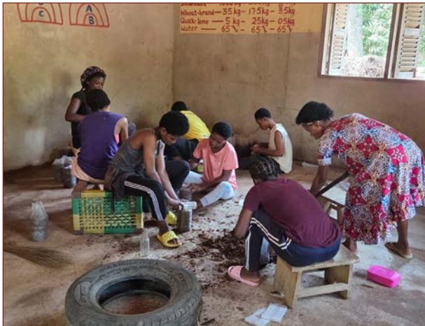
Service students help at the mushroom house with the bagging of compost.