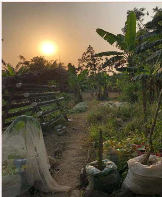
Future Lab projects at the school garden

Our tasks have changed significantly over the past few months. While at the beginning we helped everywhere, in January we started focusing on specific areas and began concrete projects.