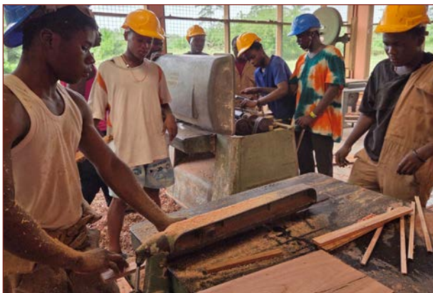
Senior carpenters at the machine shop.