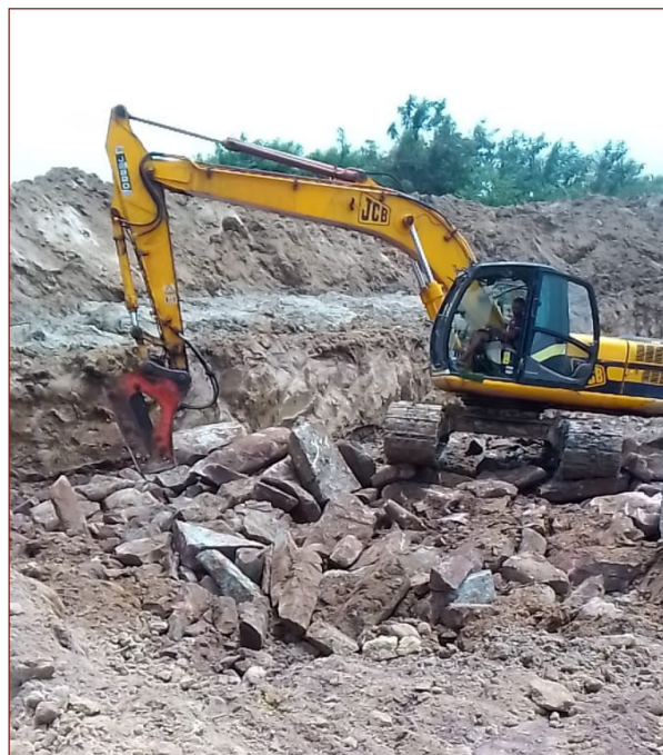
Works at the new dam