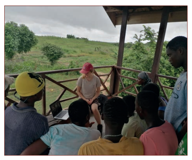
Video call with the partner class at Schweinfurt

A lot has been achieved again in the Baobab Future Lab this term. Every second Saturday and on Thursdays during homework time, the members met to further plan their projects, implement the results of their research or exchange ideas with the partner class from Germany. Three major projects were successfully implemented over the course of the term.