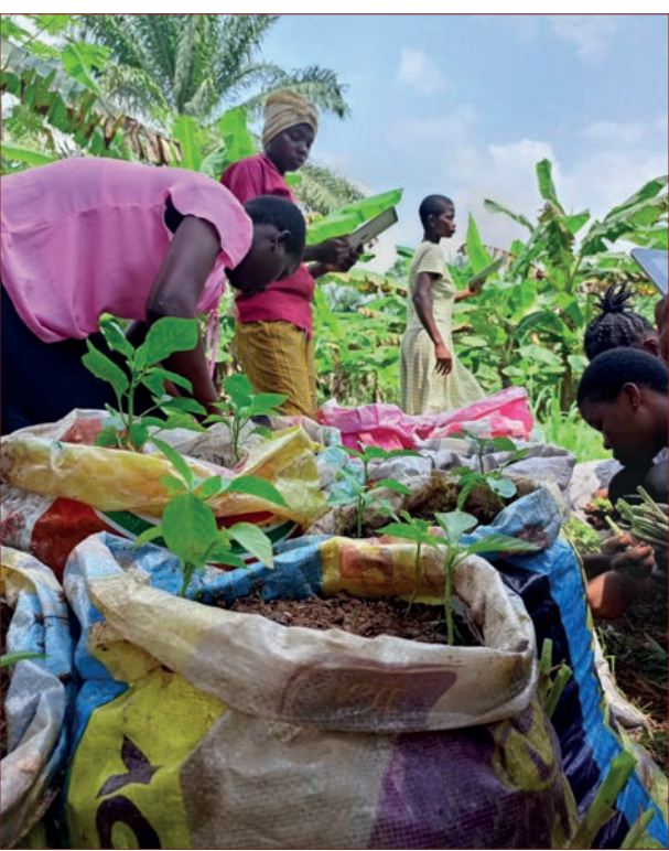
At the sides they plant in holes