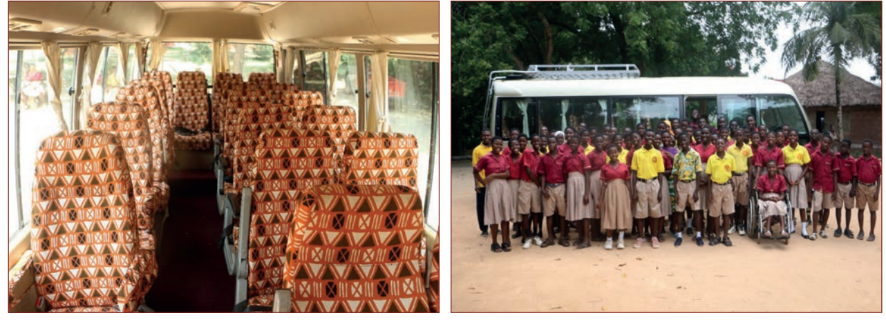
The seats were covered with Woodin Material

The old bus has been completely refurbished and now that it has been repainted it looks very nice again. We will be able to use it again for trips closer to the school, especially to the farm.