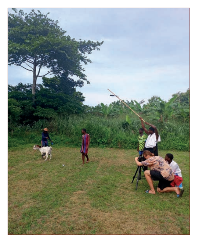
One scene is on the farm