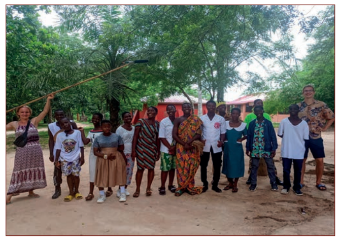
The movie song is recorded

In order to reach the local target group as effectively as possible, we produced the film in the local language, Fante. English subtitles are available and the movie can now be watched by searching for "Plastic Village Baobab Children Foundation" on Youtube. https://youtu.be/SRHSB6_fpGo