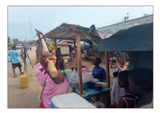
Scene at the market place

Some pupils even produced a song for the movie on their own initiative