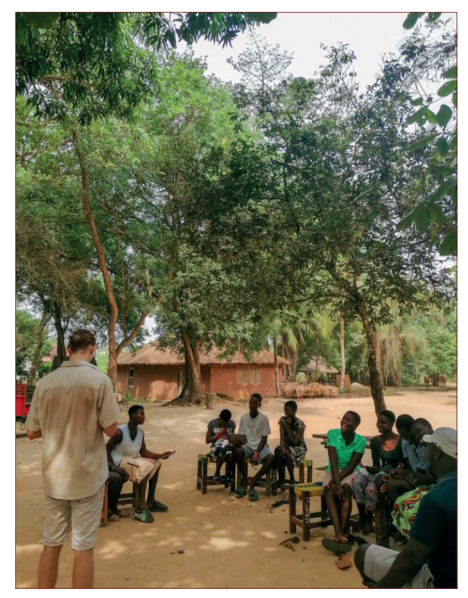
FutureLabs meeting on the school compound

A lot has been achieved again in the Baobab Future Lab this term. Every second Saturday and on Thursdays during homework time, the members met to further plan their projects, implement the results of their research or exchange ideas with the partner class from Germany. Three major projects were successfully implemented over the course of the term.