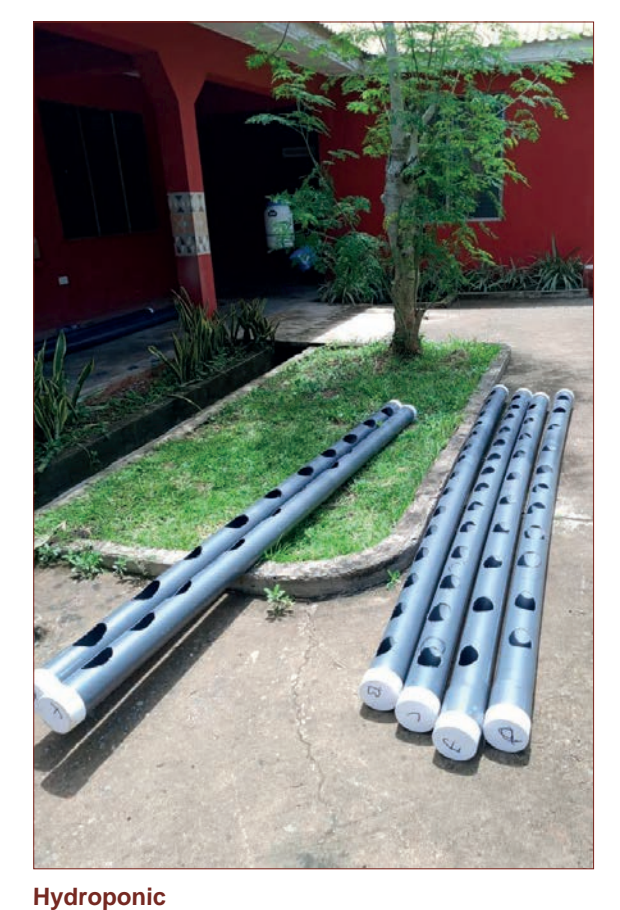
Students are explaining the Hydroponic System to the school community.