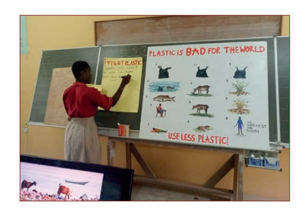
How can I fight plastic