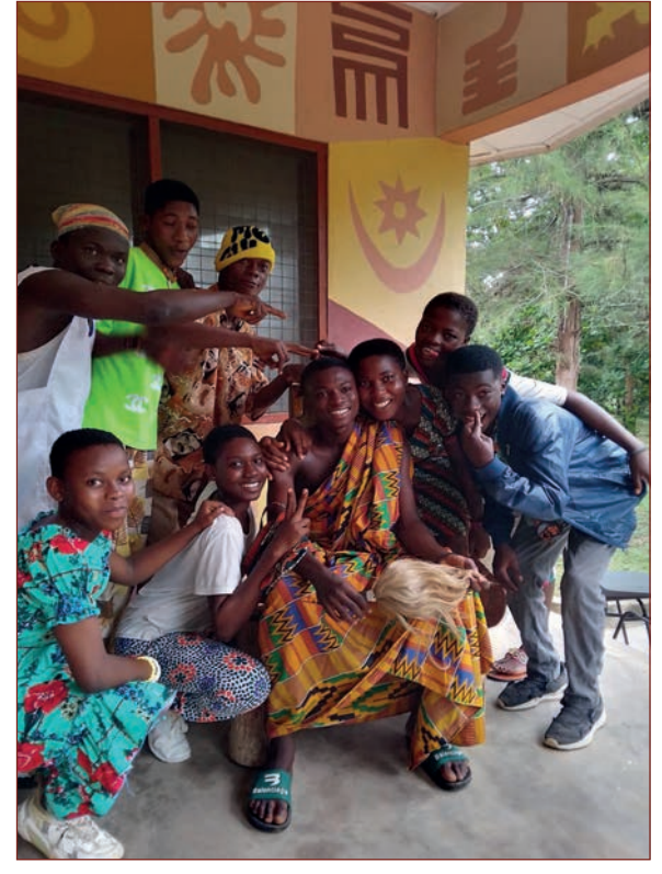
The chief comes to help.