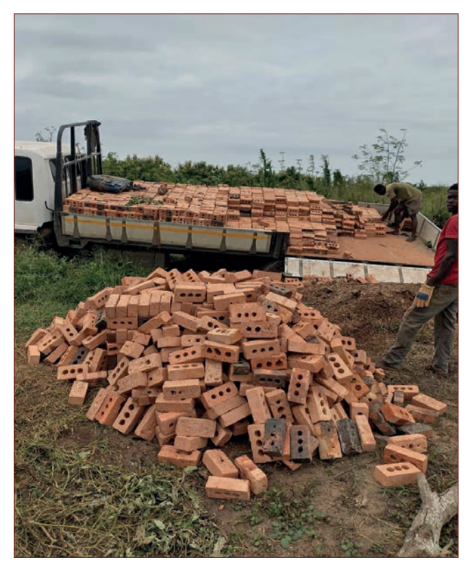
The farmhouse will be built with these burnt clay bricks.

The solar system has now also been almost fully financed by donors.