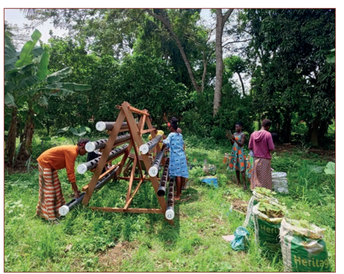
Vegetables are planted in the A-Shape structure.

In addition, the Future Lab designed its own uniform this term, which will be worn during excursions or Future Lab information events.