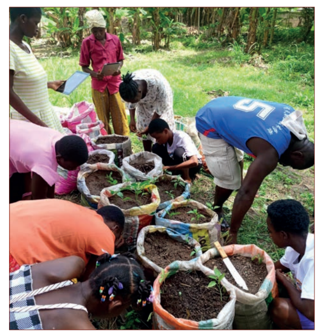
Vegetables are planted in the bags.

The students planted various spices and vegetables such as peppers, spring onions and lettuce on these bases. Even before the vacation starts they will be ready for harvesting.