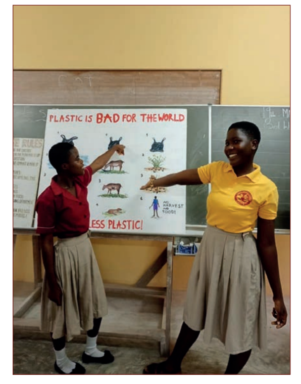
Workshop in Upper class