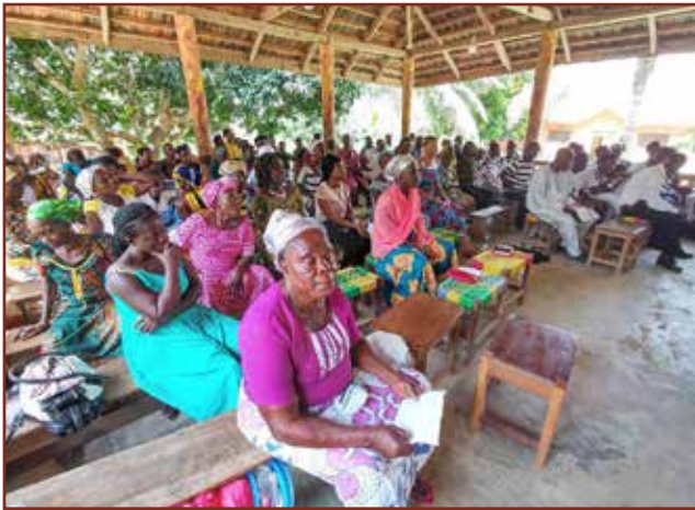
PTA Meeting and Graduation