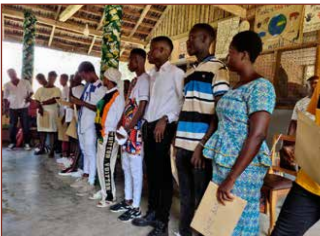
Some more advising words of staff members