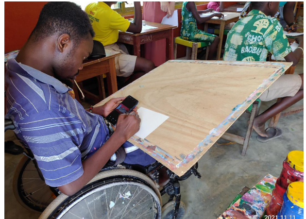
Bright, assistant teacher in special class, always busy preparing teaching material