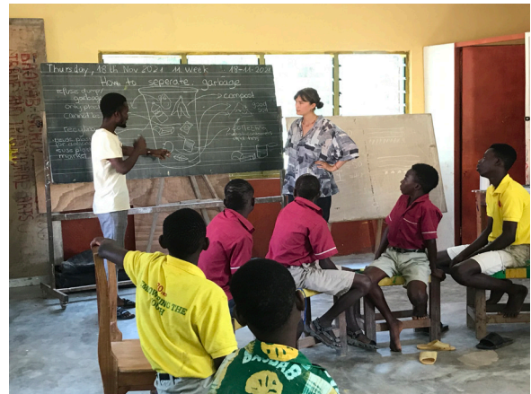
A Ghanaian visitor supports the presentation