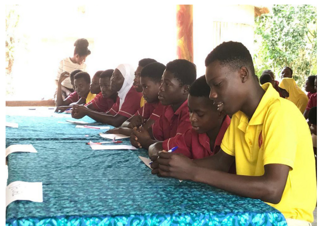
Academic Quizz Competition