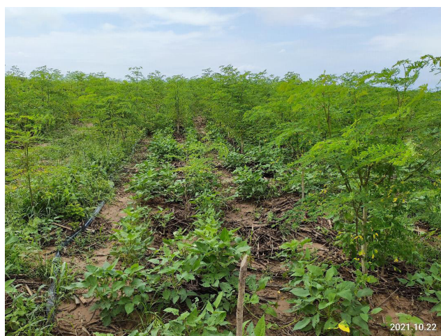
Moringa plants with intercropping

The farm has been operational since July during my absence. Many diligent hands helped to plant or sow about 24,000 moringa seedlings. All students have been equally involved in this work. Ginger, turmeric, beans and orange fleshed sweet potatoes have been planted as cash crops on the 13 acres as well. A green manure called „Mukuna“ has been introduced to enrich the soil and also to control weeds through ground coverage.