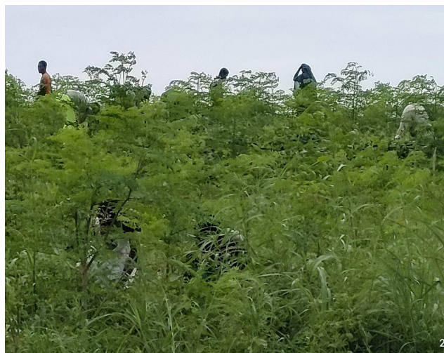
Students help on Friday's farmdays