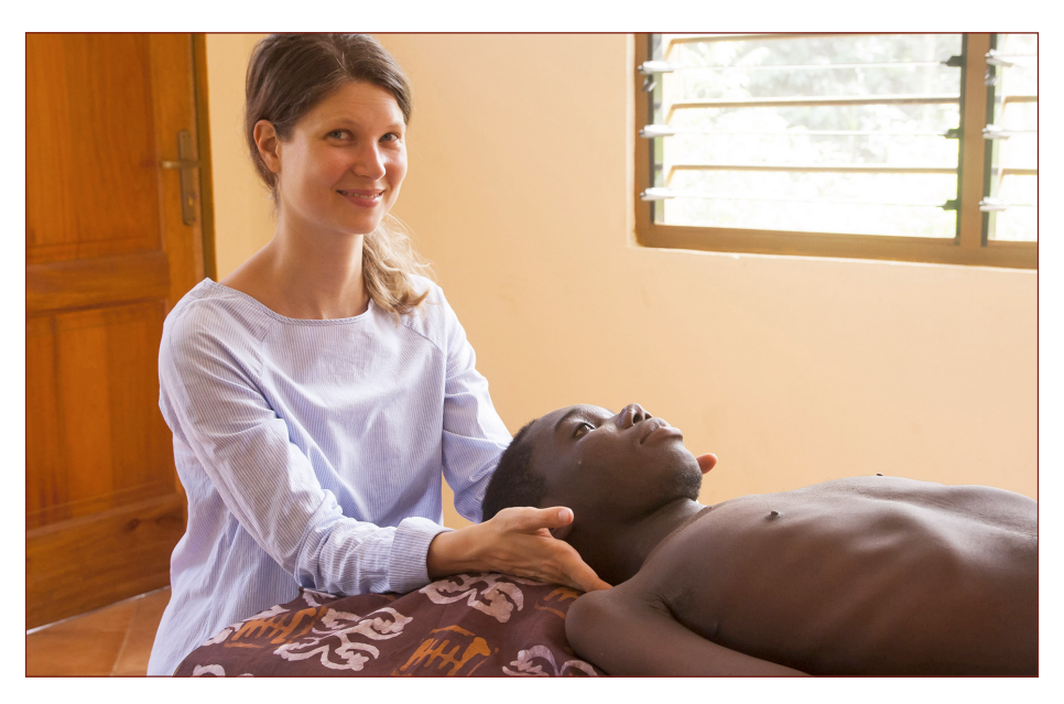
treatment of Collins

I will always remember my time at the Baobab Center as a very happy time. I was deeply touched by the children's stories and I was grateful every single day for being able to make my contribution at such a peaceful and happy place and for being part of the Baobab community